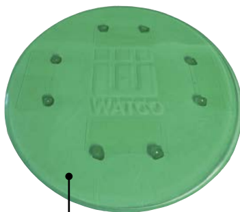
Green protective polycarbonate cover