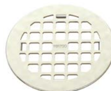
Heavy-duty snap-on grid