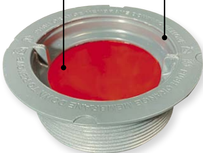
Grey PVC top piece