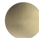
Brushed Nickel (BN)