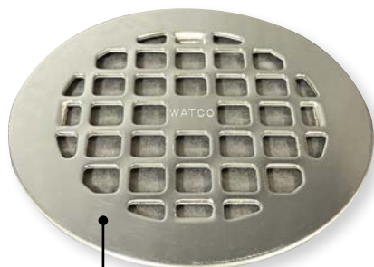
Heavy-duty grid strainer