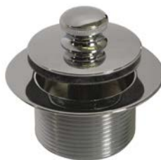
Lift and Turn (LT)