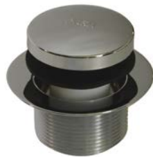
Foot Actuated (FA)